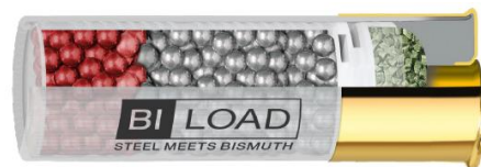
BI-LOAD 12/70 HP 36g

8 g of bismuth shot 3,8mm (N°2) + 32 g of soft iron shot 3,5mm (N°3) = 40 g pure lead-free power