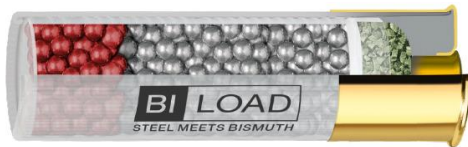
BI-LOAD 12/76 HP MAGNUM 40g

8 g of bismuth shot 3,8mm (N°2) + 32 g of soft iron shot 3,5mm (N°3) = 40 g pure lead-free power